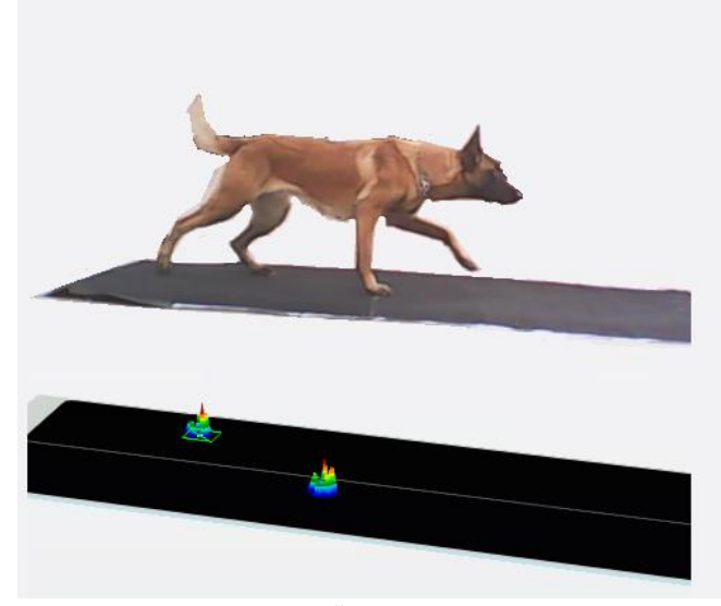
Figure 1. Pressure-sensing walkway

the platform under the supervision of veterinary physicians. An average of 30 steps were taken from each dog. Measurements were calculated by an experienced veterinary physician.