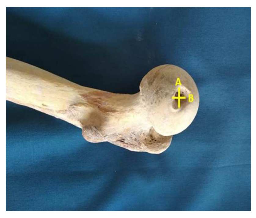
Figure 3: A. Width of the fovea for ligament of head B. Length of the fovea for ligament of head.