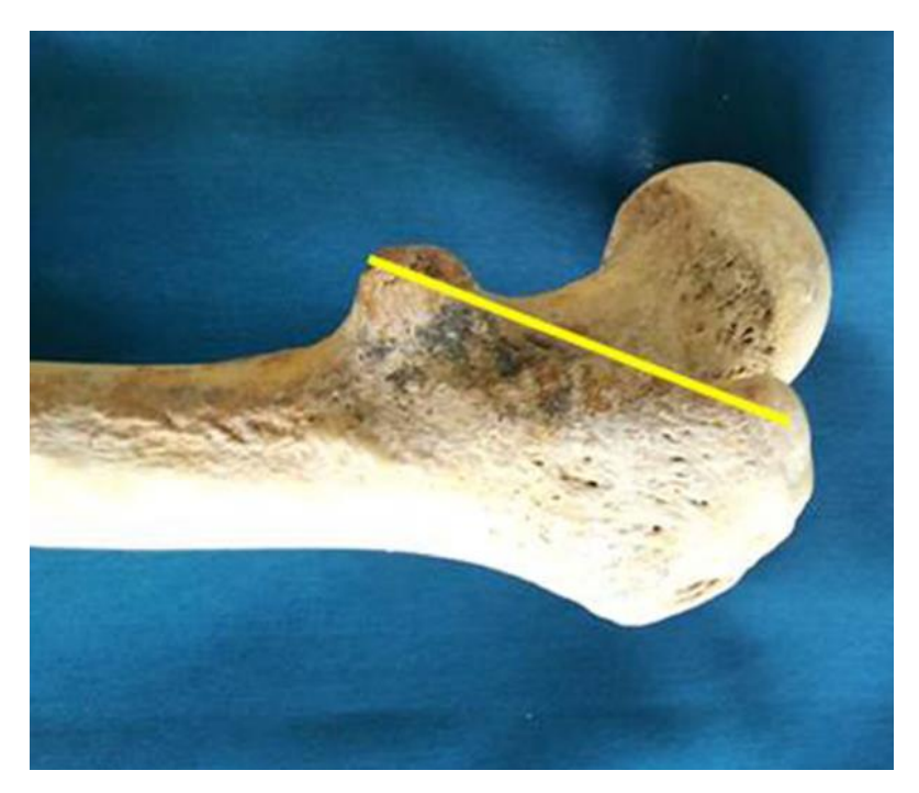
Figure 1: Length of the intertrochanteric line.