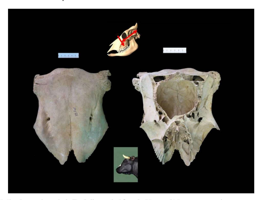
Figure 6. Slaughter marks on the bull's skull unearthed from the Metro and Marmaray excavations. Şekil 6. Metro ve Marmaray kazılarından çıkartılan boğa kafasındaki kesim izleri.

looked after well. We found, for example, widespread backbone deformations that are attributable to a wrong riding practice, and damages to the animals' jaws as a result of wrong bridle bit applications. These findings provide important clues to the way horses were kept and treated.