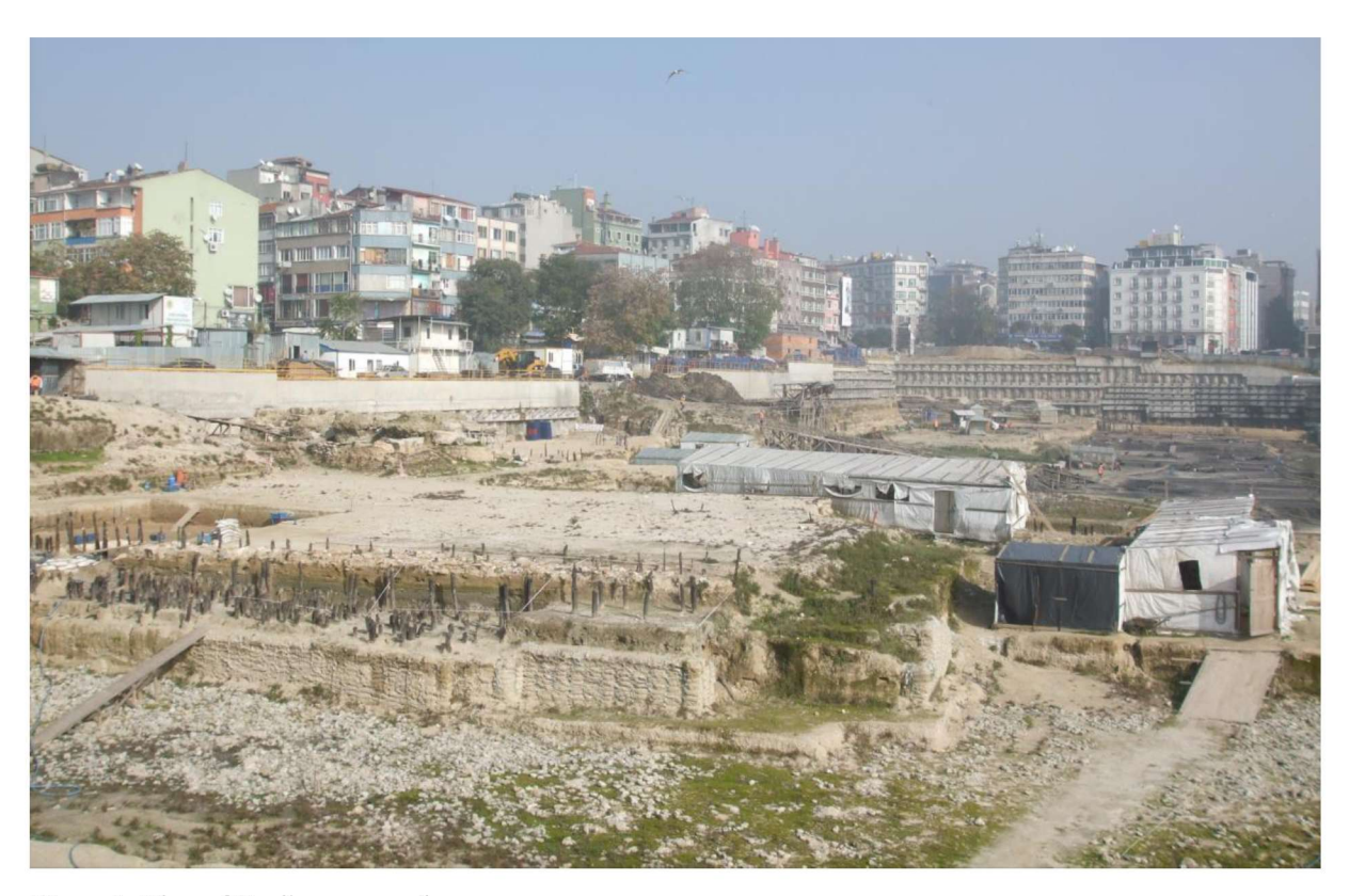
Figure 1. View of Yenikapı excavation area. Şekil 1. Yenikapı kazı alanının görüntüsü.

early as 2004 (Figure 1) with the permission of the Ministry of Culture, General Directorate of Cultural Heritage and Museums, and under the guidance of the Archaeological Museum. The excavation area of 58000 \text{ m}^2 covers two different project areas - Metro and Marmaray without, however, being subject to any projectrelated limitations. While the work in the Marmaray area has been completed in 2010, work in the Metro area is still in progress.