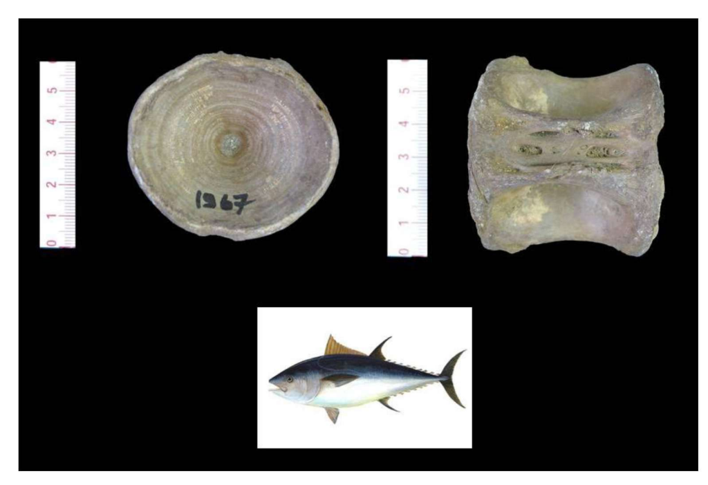
Figure 4. Tuna ( Thunnus thynnus L.) remains unearthed from the Metro and Marmaray excavations. Şekil 4. Metro ve Marmaray kazılarından ortaya çıkarılan Ton balığı ( Thunnus thynnus L.) kalıntıları.