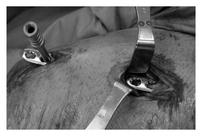
Figure 1. Application of MIPO in a comminuted femoral fracture of a dog; application of an epiperiosteal tunnel for the insertion of a compression plate locked from the distal to the proximal (Hudson et al., 2009).

Surgical approach: Because the critical neurovascular structures in the area cannot be fully visualised, the surgical approach must be undertaken with extreme caution. The incision line is 2 to 4 cm long and extends to the proximal and distal regions of the area where the plate will be put (Wagner and Frigg, 2006). In extreme instances, a third observation portal with MIPO and IM pin combinations can be used (Perione e al., 2020). Following the formation of the incision line, an epiperiosteal tunnel is opened between the proximal and distal incisions using a periosteum elevator or blunt-tipped soft-tissue scissors.