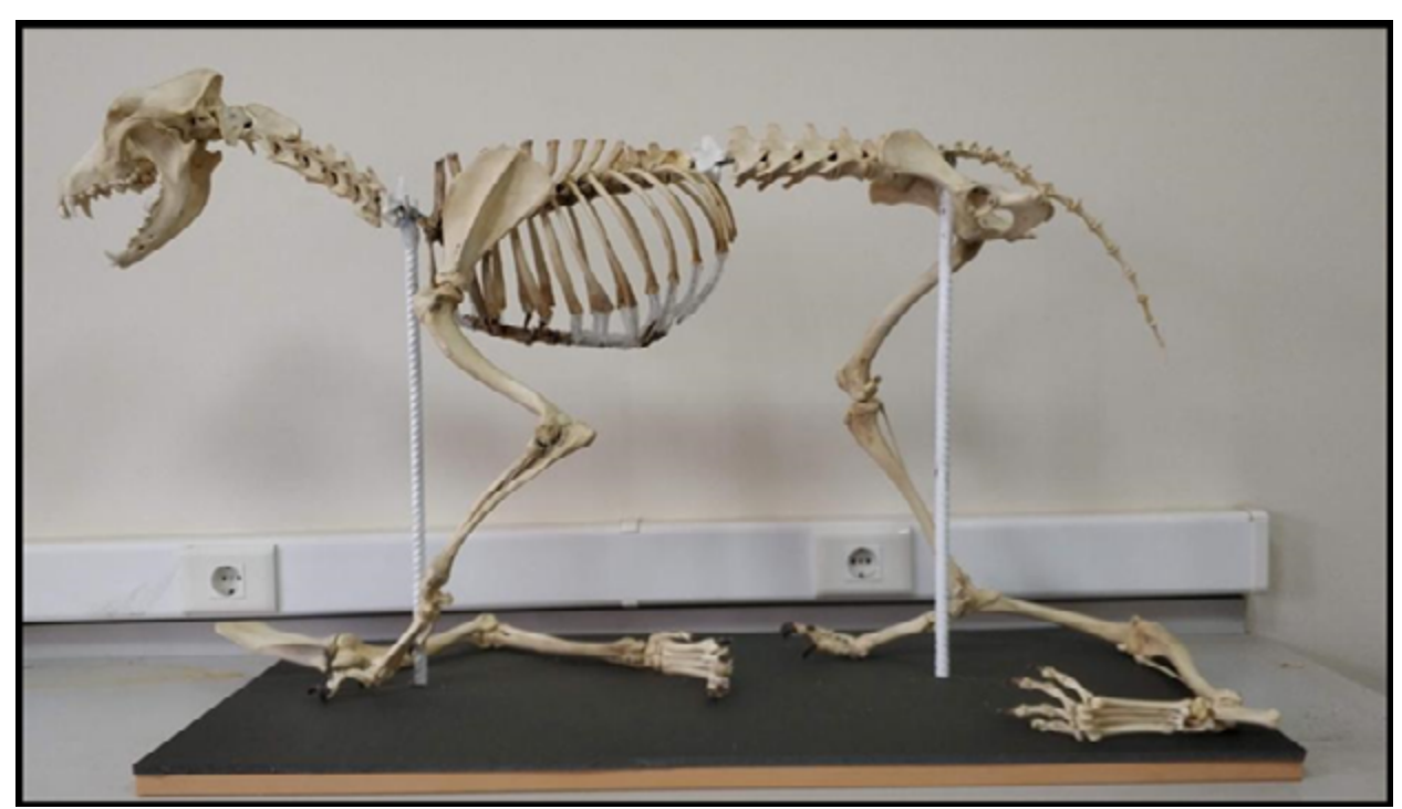
Figure 4. General view of demountable fore and hind limb bones, separated