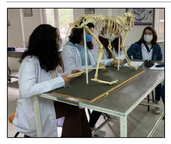
Figure 5. Students studying with demountable skeleton