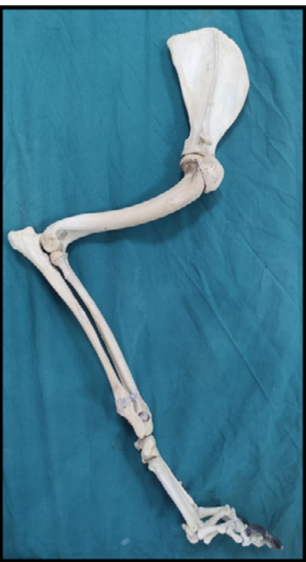
Figure 3. Demounted front leg bones (A), bringing the forelimb bones together with the help of magnets (B)