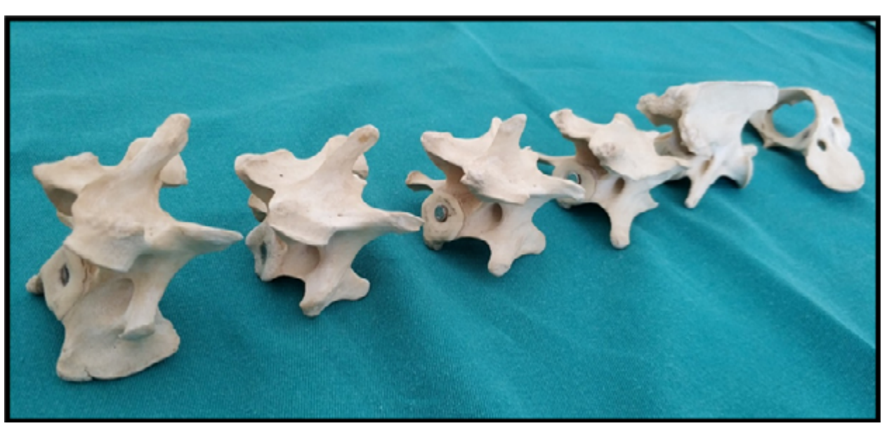
Figure 1. Placement of magnets (black arrow) on the cervical vetrebrae