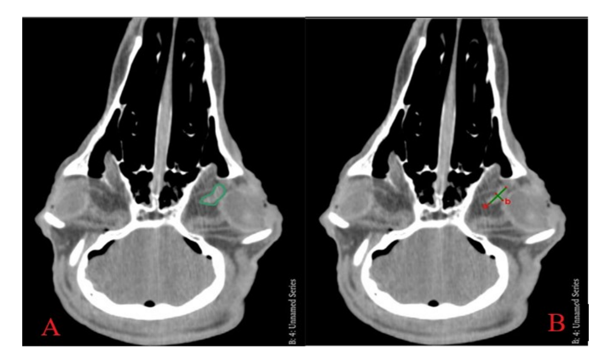
Figure 2. A: dorsal outline of the glandula lacrimalis in Hamdani sheep. B: Measurement points of glandula lacrimalis in the dorsal view in Hamdani sheep. a: Dorsal Length, b: Dorsal Width.