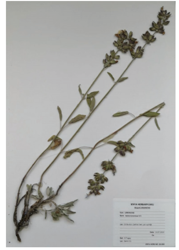
Figure 1. Herbarium archive photo of Salvia tomentosa Miller (Knya herb No: 25899).

The dried plant sample was pulverized using an electric blender. A 100 g portion of the powdered plant was suspended in 500 ml of a water/ethanol (30–70% v/v) mixture. Extraction proceeded at 180 rpm at room temperature for 8 hours in a Thermo shaker, ensuring complete solution homogeneity.<sup>31</sup> Subsequently, the solution underwent centrifugation at 5,000 rpm using a centrifuge (Hettich Rotina