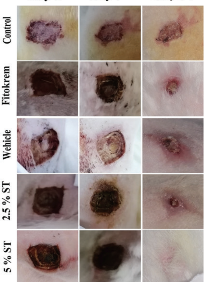
Figure 2. Wound closure levels in groups at 0, 7 and 14 days.