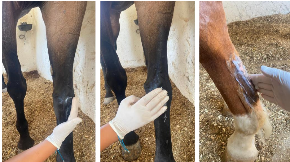
Figure 1. Oils applications to areas of concern in horses.

As shown in Figure 2, the application of thyme oil caused rashes in most of the horses. Primary irritation occurs rapidly the first time an essential oil is used, presenting as red wheal or burn. This reaction is more