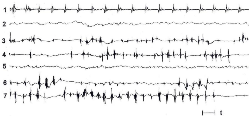
Figure 1. The 'minute rhythm' (MR) on the electromyographical recordings from the small bowel of fasted sheep. Explanations. The figure shows the representative example. At least two propagated MR episodes in the duodenum and jejunum might be observed. Identification of MR episodes in the ileum is uncertain. No MR is present in duodenal bulb and in lower jejunum. 1 – pyloric antrum, 2 – duodenal bulb, 3 – duodenum, 4 – proximal jejunum, 5 – distal jejunum, 6 – proximal ileum, 7 – distal ileum; c – electrode calibration, each bar means 100 \mu V; t – time: 10s.