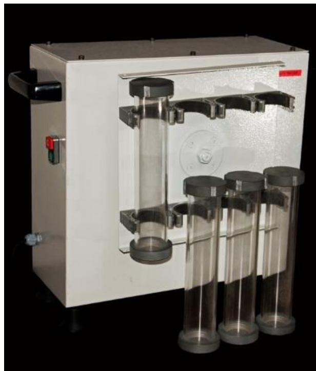
Figure 1. Phost box equipment.

Traits measured: Moisture content of the pet dry extruded foods was determined according to the AOAC (1). The durability index was measured by Phost box equipment (Figure 1) as follows: