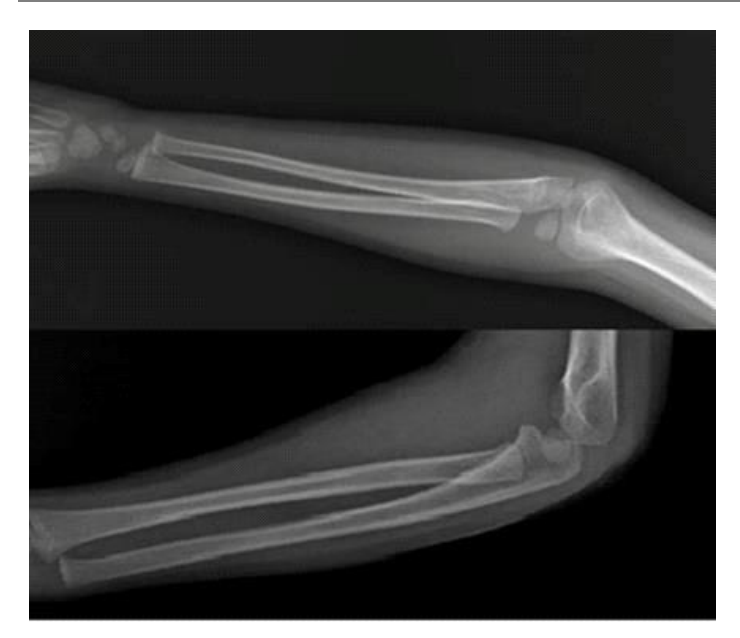
Figure 1. 6-year-old patient's left forearm AP and lateral X-Ray view. Normal X-Ray image taken at the beginning of complaints of pain and fever in the left forearm.