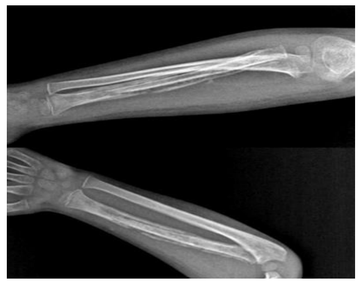
Figure 2. Left forearm AP and lateral X-Ray images taken 20 days after the symptoms started. Radius lytic lesion with periosteal reaction extending to the proximal epiphysis throughout the diaphysis.