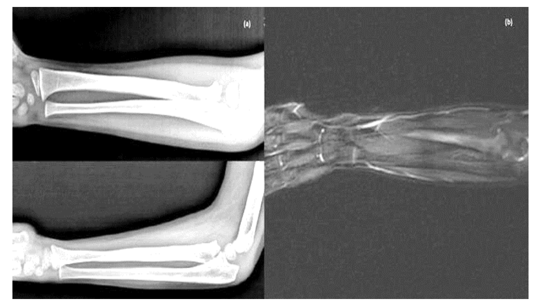
Figure 4 (a, b). (a) X-Ray image showing a significant decrease in lytic lesion taken at 6 months after surgery, (b) MRI image.