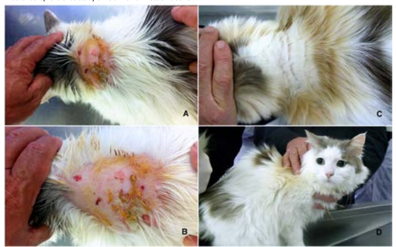
Figure 1 A, B. Ulcero-crusted skin lesions on neck of the cat.

Whole blood samples (EDTA anticoagulant) for complete blood cell (CBC) count and PCR testing, and serum samples for bio