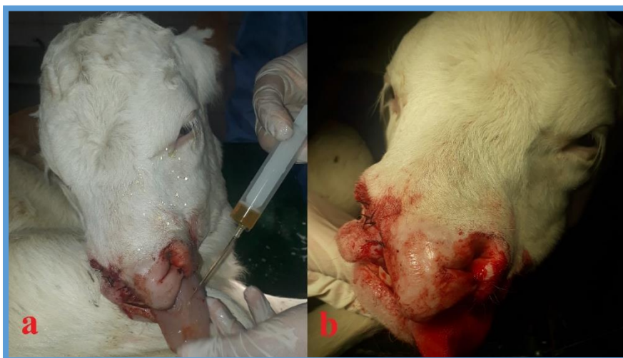
Figure 3. The patient's nostrils in their normal position after the operation (a, b).