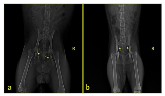
Figure 4a. Radiography of a cat with bilateral ischial fracture of the pelvic b ) Radiography of a cat with bilateral sacroiliac separation in the pelvic

Bilateral fracture of the ilium in 1 (0.9%) of the cats, bilateral ischial fracture in 6 (5.8%) (Figure 4a),