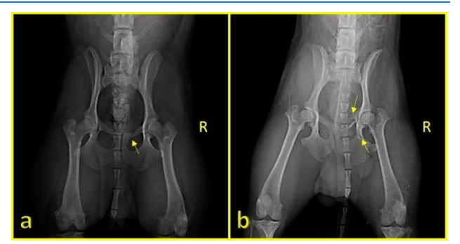
Figure 2a. Radiography of a cat with a single pelvic fracture (left ischial bone) b ) Radiography of a cat with multiple pelvic fractures (right ischial bone and bilateral sacroiliac separation)

51 left sacroiliac separations, 42 had right sacroiliac separations, and 28 had symphysis pelvis fracture (Figure 1b); If the dogs; left ilium fracture in 18, right ilium fracture in 28; 18 left ischial fracture, 25 right ischial fracture; 12 had left pubis fracture, 14 had a right pubis fracture; 14 had left acetabulum fracture, 16 had right acetabulum fracture; 23 had left sacroiliac separations, 23 had right sacroiliac separations, and 15 had symphysis pelvic fractures.