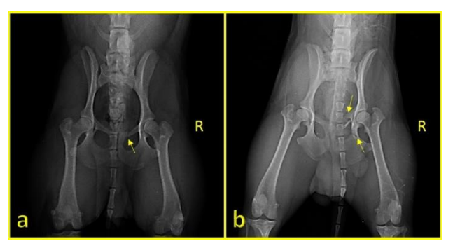
Figure 3a. Radiography of a dog with a single pelvic fracture (right os pubis) b ) Radiography of a dog with multiple pelvic fractures (right ischial bone and right os pubis)

More than one pelvic bone was fractured in 136 of the 183 cases in cats and dogs. Of the 103 cases in total, 25 (24.2%) of the cats had a single pelvic bone (Figure 2a), and 78 (75.8%) had more than one pelvic bone (Figure 2b). In dogs, 22 of 80 cases (27.5%) had a single pelvic bone (Figure 3a), and 58 (72.5%) had multiple pelvic fractures (Figure 3b).