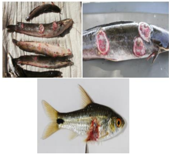
Figure 2. Ulcers on the lateral and fins due to EUS effect (FAO, 2020; Huchzermeyer et al., 2012).