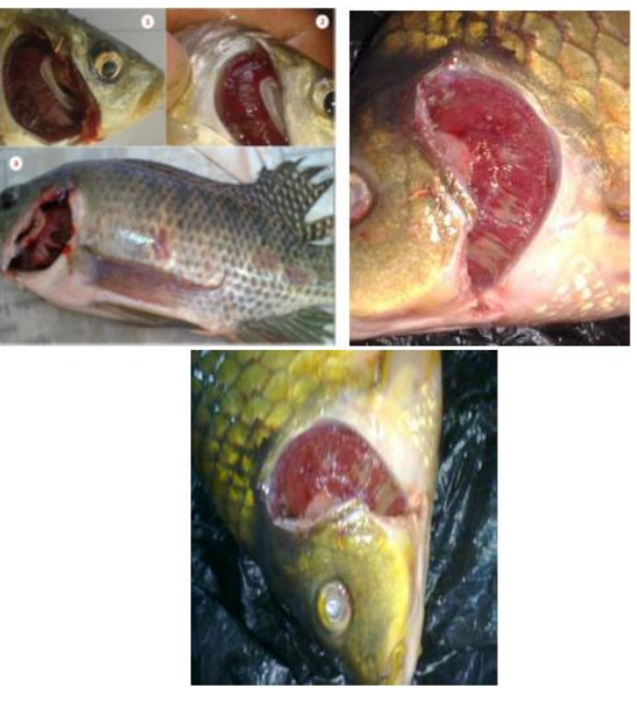
Figure 3. Pale, necrotized, and obstructed gills caused by branchiomycosis (Khalid Subhi, 2011; Riad et al., 2015).

skin and tail region (Figure 4) (Govind et al., 2012). An emery-paper-like appearance is particularly noticeable on the fungi granulomas due to epithelial loss. Besides, it affects the central nervous system, particularly in salmonids, as a result of which neurological symptoms such as swimming and balance disorder, swaying movement are observed in fish (Hodneland et al., 1997). The disease mainly attacks the liver. Apart from the liver, the spleen, heart, kidney, gonads, brain, gills, muscles, and nerve tissues behind the eyes are severely affected. Spinal curvature has been observed in some fish (Govind et al., 2012). The prognosis of the disease varies according to the host involved and environmental conditions (Kocan et al., 2009). There is no cure for the disease. The contaminated feed should be avoided, and factors causing stress should be eliminated (Choudhury et al., 2014).