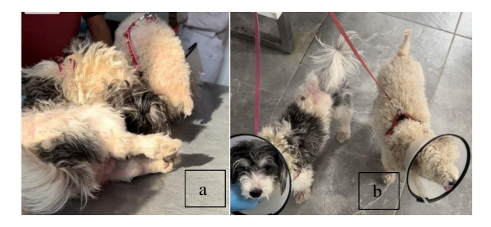
Figure 4: Two dogs enrolled at this study and subjected to hSmT with photographic records obtained on days a) 0 and b) 10. There was no more pruritus, which was one of the criteria for treatment success.