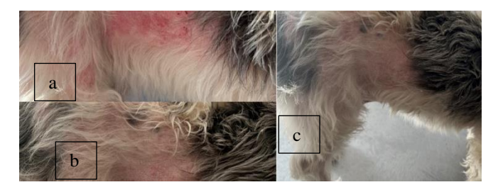
Figure 3: Case I at referral (prior to hSmT) on day 0 ( a ), 5 ( b ) and 10 ( c ), respectively thereafter hSmT. No more pruritus was evident.

results, Vas pruritus scores and triage coloring. Interestingly owners were also cured following treatment of both dogs, despite previous therapeutical drug applications (medical doctors for owners, referring veterinary surgeon for dogs) without success.