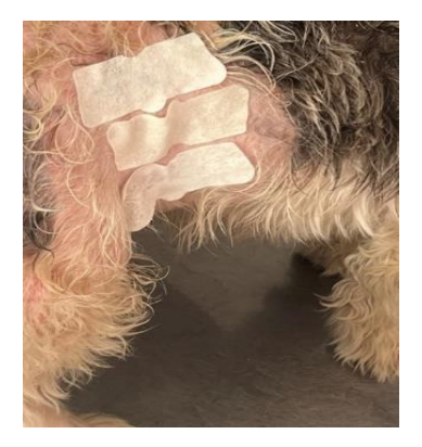
Figure 1: Clear up test strips were used as hSmT vehicle at this study.

Written owner consent was deemed available for all participant dogs. Day 0 was defined as initial day for heterelog skin microbiota transplantation (hSmT) and it was repeated twice (second application was on day 5). Prior values were analyzed by the help of responsible veterinary surgeon at field conditions (day -14 to day 0 analytes).