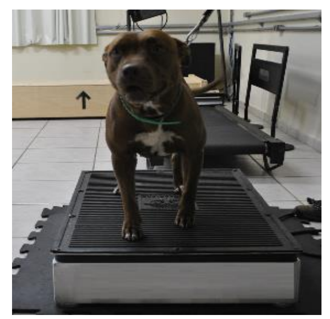
Figure 1. Dog standing on the top of the vibrating platform which delivered a vortex wave circulation, and with a leash to prevent from moving or sitting.

The vibrating platform (92 cm length, 62 cm width, and 16 cm height) delivered a vortex wave circulation (TheraPlate Revolution, Texas, USA) that was used to promote the WBV. During the sessions, dogs remained on the top of the vibrating platform in a standing position without any sedation, and a leash was used to prevent them from moving or sitting (Figure 1). The dogs were exposed to single WBV at frequencies of 30 Hz [peak displacement (Dpeak)=3.10 mm; peak acceleration (Apeak)=11.16 m s-2) for 5 min, 40 Hz for 5 min (Dpeak=3.37 mm; Apeak=21.59 m s-2 peak acceleration), and 50 Hz for 5 min Dpeak=3.98 mm; Apeak=39.75 m s-2). The mean interval between each frequency exposure was 10 min. The frequency was determined by the manufacturer and checked by a digital oscilloscope (Mustool MDS120M, Mustool, California, USA), and for peak acceleration acquisition was used a 3-axis digital accelerometer sensor (STMicroelectronics, São Paulo, Brazil) was placed at the center of the vibrating platform. The peak displacement was calculated by using: Dpeak=Apeak/(2.f)2, f frequency (4, 13).