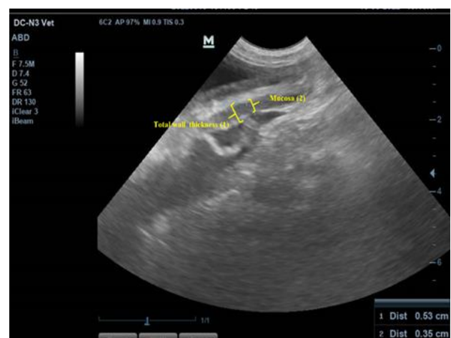
Figure 4. Post-treatment US appearance of duodenum.