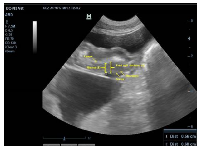
Figure 3. Pre-treatment US appearance of duodenum.

All treatment protocols applied to the dog are summarized in Table 3. Also, a fat-restricted but protein-rich diet was applied to the dog with the initiation of the first treatment protocol. Despite these first two treatment protocols, the patient's clinical and laboratory findings have not improved, so exploratory laparotomy was performed. In the exploratory laparotomy, approximately 10 liters of free fluid (ascites) was drained from the abdomen (Figure 2). On the inspection, thickening was observed in some areas of the duodenum and jejunum. Punch biopsy samples of approximately 3 mm in size, including all intestinal layers, were taken from this thickened area of the duodenum and jejunum. Also, punch biopsy samples were taken from the pancreas. Biopsy samples were sent to the Department of Pathology for histopathological examination.