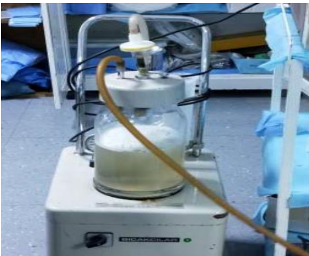
Figure 2. Ascites fluid in the abdomen (10 L).

Diagnostic procedures: The haemogram and serum biochemistry results are presented in Table 1 and Table 2. There were no parasites in the fecal examination and the occult blood test was negative. Also, there was no abnormality in the results of the radiographic, electrocardiographic, and echocardiographic examinations. The anechoic-free fluid (ascites) in the abdomen was observed in the ultrasonographic examination. In the ultrasonographic examination of the intestines, it was found that the total wall thickness increased (0.68 cm), especially the mucosal layer was 0.56 cm. Since it is known that the normal total wall thickness of the duodenum in dogs is 0.53 cm or less (7), it was determined that the mucosal layer thickness was increased in this dog (Figure 3). Also, rivolta test of the abdominal fluid (ascites) that was taken by abdominocentesis was determined as transudate. Also, there were no abnormalities detected on the urinalysis of the dog. On the other hand, the patient's TLI value which was measured by using a commercial assay (Canine TLI-RIA, Siemens Medical Solutions, Malvern, PA) was found to be lower than the references. Based on clinical signs and laboratory