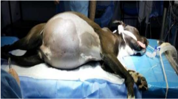
Figure 1. Abdominal distention (dilatation with ascites fluid).