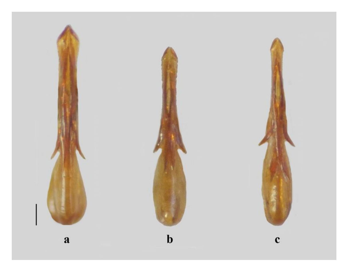
Figure 2. Frontal wiev of aedeagus of three Aphrodes spp. a) Aphrodes makarovi , b) Aphrodes bicinctus , c) Aphrodes diminuta (Scale bar: 0,1 mm)