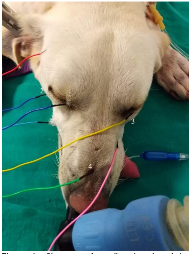
Figure 1. Placement of needle electrodes during electromyography recording includes 1) cathode stimulating electrode, 2) ipsilateral recording electrode, 3) contralateral recording electrode, 4) ground electrode.

silver needle electrodes (2-2.5 mm). To stimulate the eye, the cathode was placed along the supraorbita of the frontal bone, 1 cm dorsally to the medial canthus of the eye, where the supraorbital nerve exits the orbital space, and the anode was used as a reference electrode. Needle electrodes were placed on the lateral parts of the right and left ventral eyelids to obtain recordings from the orbicularis oculi muscle. The needle electrode placed on the nose was used as a ground (Figure 1).