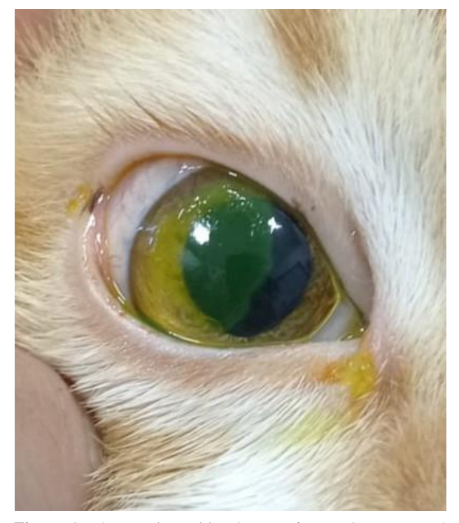
Figure 1. Fluorescein-positive image of a persistent corneal ulcer due to herpes virus in a 7-month-old tabby cat.