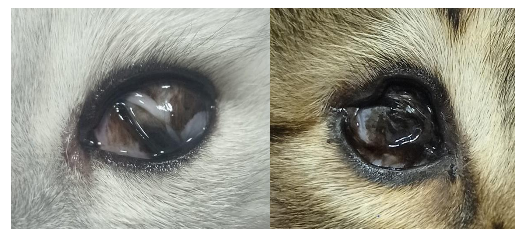
Figure 3. 6-month-old British Shorthair cat with severe conjunctivalization and symblepharon (left). A 1-year-old domestic shorthair cat with ankyloblepharon and symblepharon. The third eyelid adhesion to the corneal surface. Ankyloblepharon is seen at the lateral canthus of the upper eyelid (right).