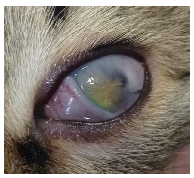
Figure 2. Severe conjunctivalization in a 5-month-old tabby cat. It is noteworthy that the limbus disappears completely, conjunctivalization progresses towards the center in the entire dorsolateral quadrant of the cornea, and the presence of superficial vascularization covering the entire surface of the cornea.