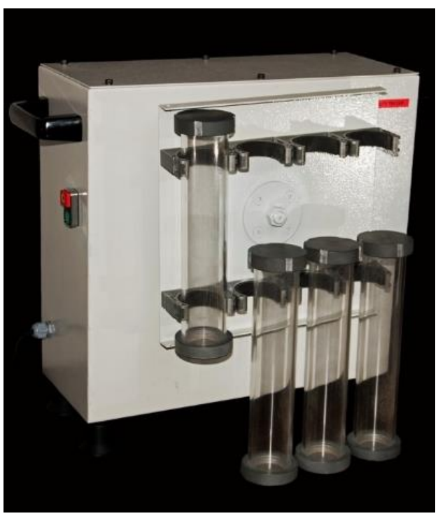
Figure 1. Phost box equipment. Şekil 1. Phost box aleti.

Traits measured: Moisture content of the pet dry extruded foods was determined according to the AOAC (1). The durability index was measured by Phost box equipment (Figure 1) as follows: