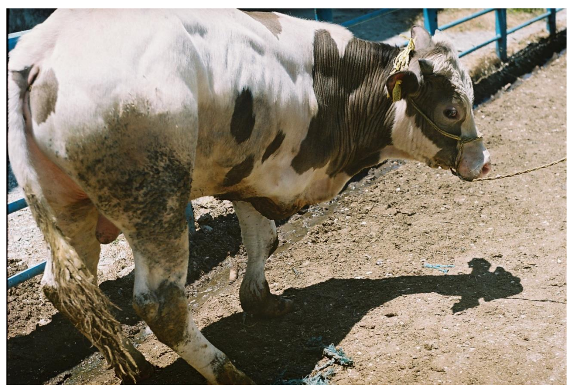
Figure 1: Gross appearance of the right forelimb peromelia in cow. Şekil 1: Sağ önbacak peromelili dananın görüntüsü.