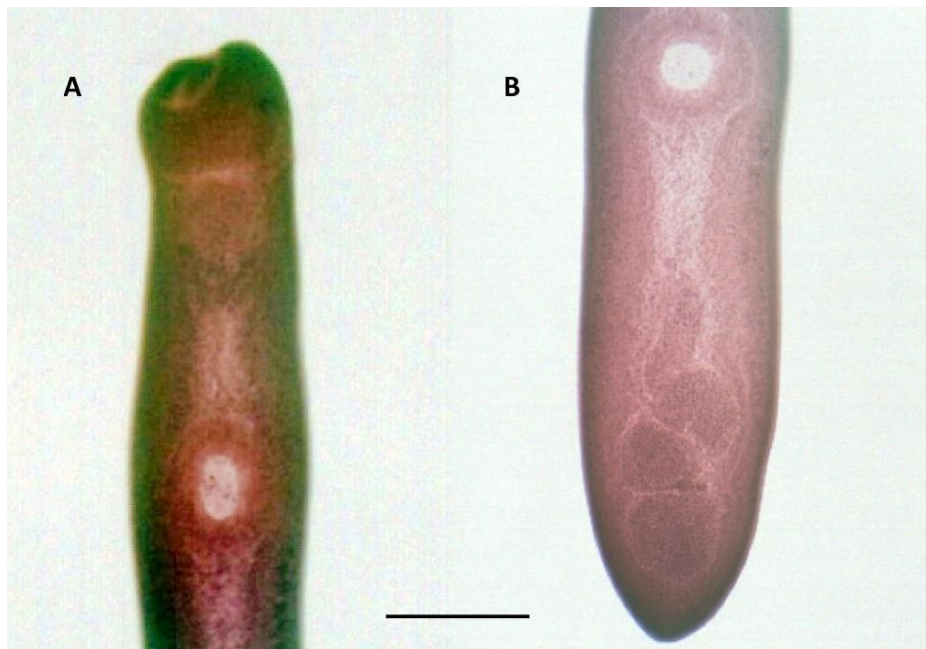
Figure 1. Brachylaima sp. collected from magpie 3. A) Anterior part, B) Posterior part. Bar line shows 0.4 mm.

Şekil 1. Saksığan 3'ten toplanan Brachylaima sp. A) Anterior kısmı, B) Posterior kısmı. Bar çizgisi 0,4 mm'yi göstermektedir.