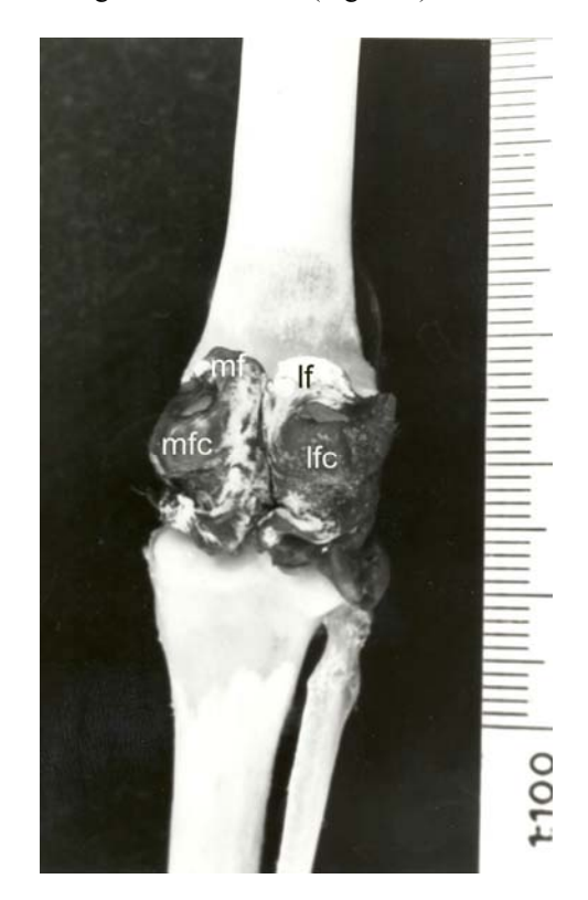
Figure 2. Photograph of the knee joint – caudal aspect Şekil 2. Diz ekleminin caudal'den görünümü The edge of the lateral (lf) and medial fabella (mf), lateral femorotibial compartment (lfc) and medial femorotibial compartment (mfc)

The joint capsule was caudally separated into two parts as lateral and medial by cranial and caudal cruciate ligaments. Proximally, the joint capsule was found to be begun from the edge of the articular surfaces of sesamoids of the femur and extended distally connecting to the edge of the sesamoid bones. Distally, the joint capsule was observed to be connected to the proximal border of the menisci and continued among the menisci, collateral ligaments and tibia (Figure 2).