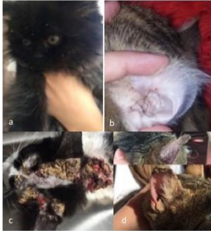
Figure 2. Different cats with common history of pruritus associated with head/facial dermatitis. a) Cheyletiellosis with extensive scaling and pruritus b) early signs of allergy/hypersensitivity presenting erythema, crusting on inner auricular region c) extensive crusting, erythema due to Pemphigus foliaceus d) ear margin dermatosis due to food allergy and Alternaria sp. infection.

Şekil 1. Yaygın olarak gıda alerjisi geçmişi bulunan baş/yüz dermatitli dört farklı kedi. a) bilateral periorbital skuam, eritem ve alopesiyle birlikte burun bölgesinde kabuklanma b) yalama ve kaşıntıya neden olan baş bölgesinde yaygın alopesi c) gıda değişimini takiben görülen kaşıntıyla birlikte eritem ve alopesi d) periorbital bölgede tek taraflı şiddetli kabuklanma ve burun bölgesinde yaygın kaşıntı geçmişi.