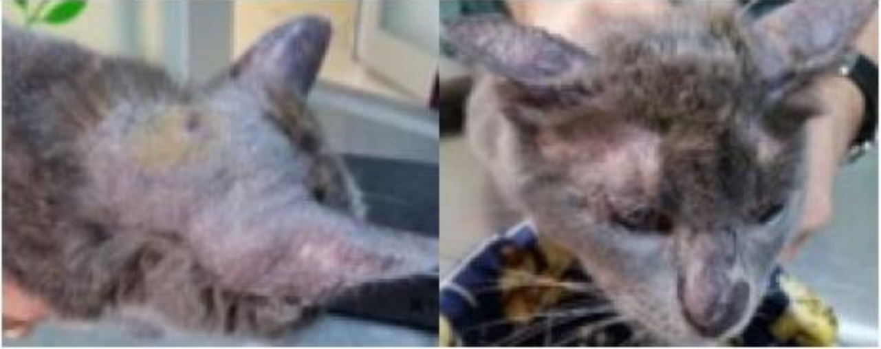
Figure 3. This cat with severe pruritus showed IgE against 18 out of 20 allergens (classified as weak, strong or very strong). There was very strong IgE response against Tyrophagus and Flea allergens.

Şekil 3. Şiddetli kaşıntı mevcut kedide 20 alerjenden 18'ine karşı IgE tespit edildi (zayıf, kuvvetli ya da çok kuvvetli olarak sınıflandırılacak şekilde). Tyrophagus akarı ve pireye karşı kuvvetli IgE yanıtı tespit edildi.