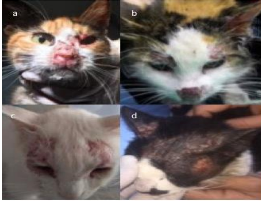
Figure 1. Four different cats with head/facial dermatitis with a common history of food allergy. a) bilateral periorbital scaling, erythema and alopecia along with muzzle crusting b) general alopecia on the head with extensive grooming and itching behaviour c) erythema and alopecia accompanying pruritus following dietary change d) severe crusting on unilateral periorbital region and muzzle with the history of extensive pruritus.

Şekil 1. Yaygın olarak gıda alerjisi geçmişi bulunan baş/yüz dermatitli dört farklı kedi. a) bilateral periorbital skuam, eritem ve alopesiyle birlikte burun bölgesinde kabuklanma b) yalama ve kaşıntıya neden olan baş bölgesinde yaygın alopesi c) gıda değişimini takiben görülen kaşıntıyla birlikte eritem ve alopesi d) periorbital bölgede tek taraflı şiddetli kabuklanma ve burun bölgesinde yaygın kaşıntı geçmişi.